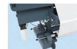
Automatic Media Feeder

The TS5-1600AMF is equipped with a feeding and take-up system (AMF) that enables smooth media handling for heavy rolls of transfer paper and thin and flimsy media up to 38 kg. The TS3-1600 is equipped with a standard take-up device that can hold media up to 25 kg.